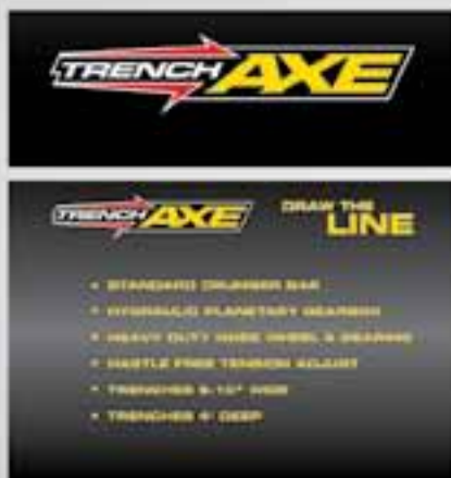
MTB-236 - Trench Axe Sign (43" x 29")