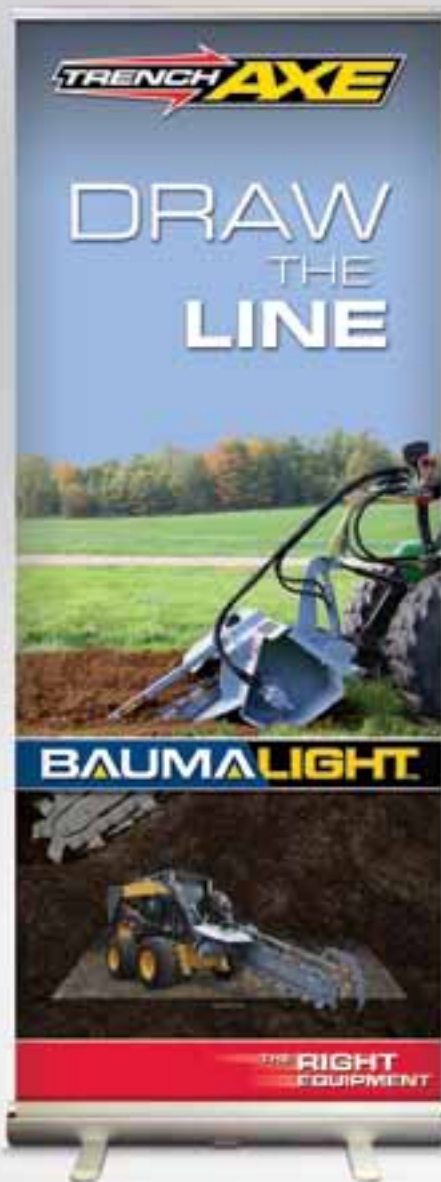
D001663 - Retractable Banner Stand (30" x 80")