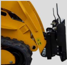
D006489 - BAUMALIGHT FM PLATE TO BOBCAT MINI MALE CHEATER