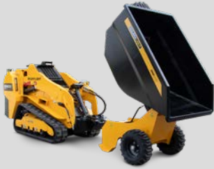
TRAILER DUMPER BAUMALIGHT

SOLD BY EQUIPMENT DEALERS FOR LOCAL SUPPORT