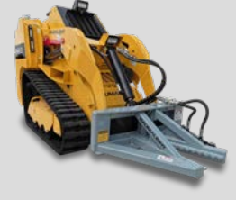
TREE PULLER BAUMALIGHT