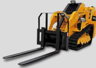
PALLET FORK MARTATCH