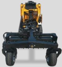
POWER RAKE WIFO