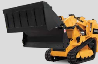
4-IN-1 BUCKET MARTATCH