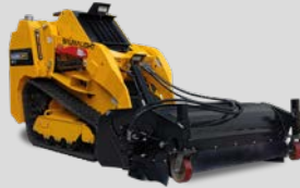
PICK-UP SWEEPER MARTATCH