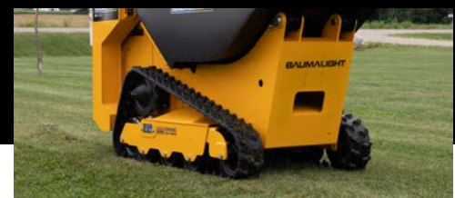
7.84 KM/h Ground Speed