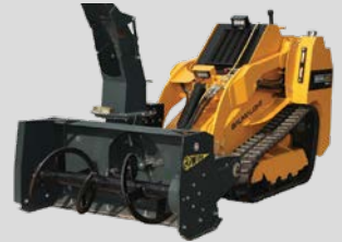
SNOW BLOWER WIFO