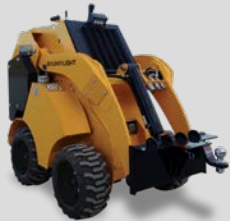
BALL HITCH BAUMALIGHT