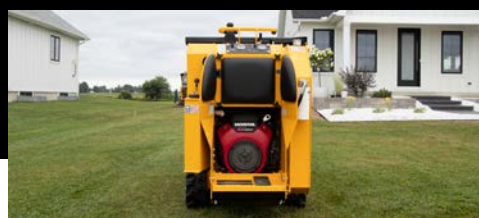
Stand-in Operator Compartment