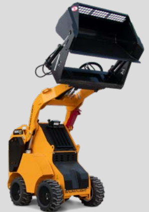
HIGH DUMP BUCKET MARTATCH