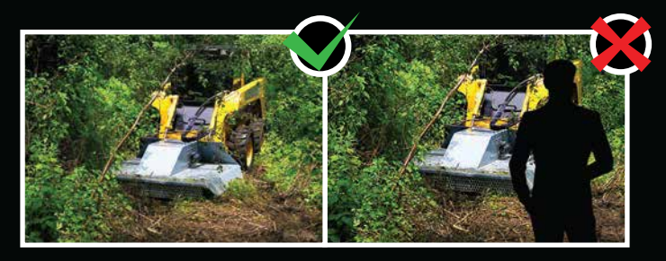
Show the product in action, don't do on-screen commentary.