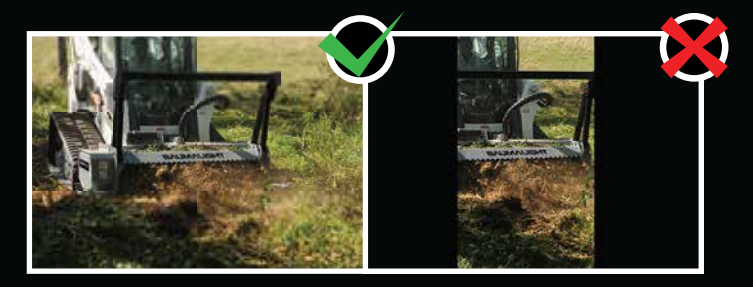
Shoot in Landscape mode, not portrait mode.