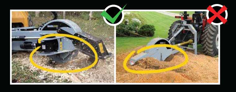
Show as much action as possible, do not hide the action.