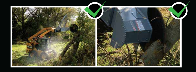
Shoot from a variety of angles and zoom positions.