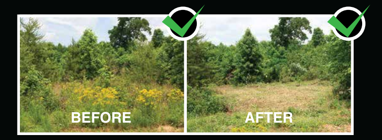
Try to show a good "Before & After" view of your work space.