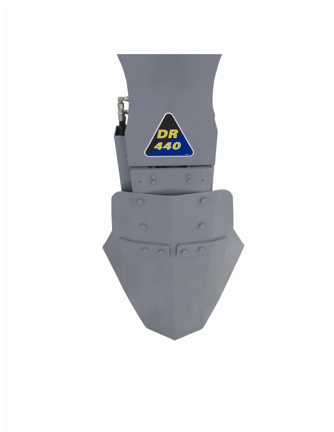
Figure 1 Blade Shown From Back, Hydraulic Connections in Upper Right Corner

Each of the four blades is located in a track which is attached to the base. The blade is operated individually by a hydraulic cylinder that is, in turn, operated by an electric solenoid-operated valve that the operator controls from the control panel.