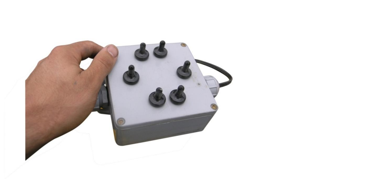
Figure 3 General Arrangement of Controls

Figure 3 is a simple overview of the general function of the controls. On the right side is the cord that connects to the control box on the Tree Spade. On the left side is the power supply that connects to a 12 VDC power socket on the vehicle.